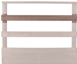
Plank 12 meter walker