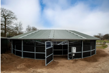
Fencing for a 12-meter roof