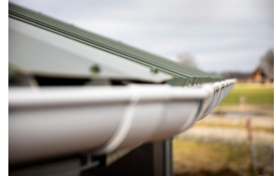
Rain gutter 11 sections