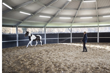
Lunging fence for a 15-meter roof