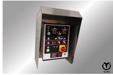
Control box cover