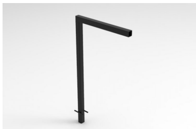
Adjustable Ground Bracket