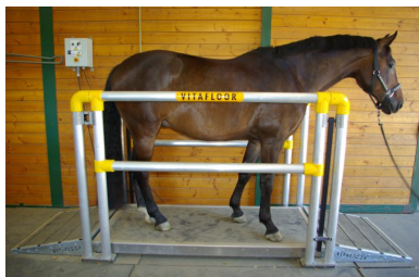
Bracket set for VME