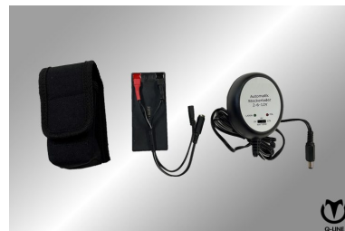
Battery Set for Roll-Up